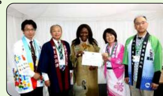
Main representatives with Dr. Mumba (middle)

In the evening, we got to meet Dr. Musonda Mumba, the Secretary General of the Ramsar Convention. She has been involved in international environmental efforts for years, and even started the Network of African Women Environmentalists. We had only 15 minutes of her time, but she sat down with the main representatives and spoke with them a little. My role here was to interpret from Japanese into English. The other interpreter was very supportive in interpreting Dr. Mumba's words into Japanese for us. They introduced themselves, and showed her the video message from the Mayor of Koriyama. We had brought some gifts for her to highlight Fukushima. From AizuWakamatsu, we gave her an Aizu lacquerware coffee cup, and an Akabeko. Then, it was time for the photo. If you saw the newspaper article, that photo was from this moment! I'm standing outside of the camera view to support those I can.