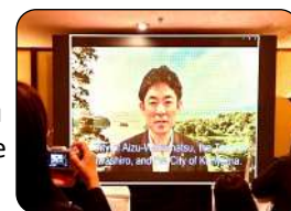
The video message from the Mayor of Koriyama

It was MC'd in English by the Ministry of Environment of Japan who introduced the speakers, and main representatives from Fukushima. As the largest of the three cities representing Lake Inawashiro, Koriyama City gave the main speech. The leader, wearing a yukata, gave a small speech in English, thanking Ramsar for the designation, and everyone for coming. She did a wonderful job! Then they played a video message from the Mayor of Koriyama with English subtitles, and a PR video of Lake Inawashiro. A representative from AizuWakamatsu closed off our portion with a promise to protect the beauty of Lake Inawashiro, and a hearty 'Thank you!' I was very impressed with the effort everyone put into preparing for this moment. They had to speak in English, and all did really well! I felt really proud to be there to support them.