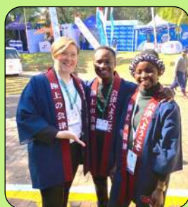
The people from Kenya were interested in Aizu!

Aizu kanji(會津) on the back is also used in his language. A group of young people from Kenya wanted a happi themselves! So, we let them try the coats on and took some pictures together. Some people were interested in the 'Samurai City' pamphlets we had at the booth. I love Aizu, so I was very grateful for the opportunity to share information about AizuWakamatsu and Fukushima with many people from around the world.