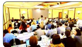
There were many people at our event

After lunch, it was time for our main event! Our event provided a space Lake Inawashiro to be recognized, and for researchers from Japan and Korea to share information on the usefulness of rice paddies as environmentally protected areas.