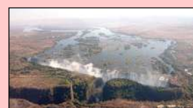
Victoria Falls (Mosi-oa-Tunya)

The conference itself took place in Victoria Falls, Zimbabwe from July 23 rd to July 31 st . Zimbabwe is located in Southeastern Africa, next to Zambia, Mozambique, South Africa and Botswana.