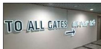
Transfer sign at the Addis-Ababa Airport in Ethiopia

In total, eleven people from various government organizations in Fukushima went to Zimbabwe: two from Fukushima Prefecture, two from Inawashiro Town, three from Koriyama, two from AizuWakamatsu City, plus me and one other interpreter. They were from the Environmental divisions in their various governments and were very happy to be