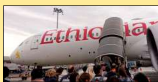
Ethiopian Airlines flights to Zimbabwe

This year, Lake Inawashiro was placed on the Ramsar List and recognized as a 'Wetland of International Importance especially as Waterfowl Habitat.' Part of the UNESCO umbrella, the Ramsar List is maintained by the 'Convention on Wetlands' Contracting Parties,' made up of about 172 countries committed to protecting wetlands around the world. They met this year at the end of July to update the Ramsar Convention, recognize newly designated wetlands and share information. I was lucky enough to go as an interpreter for representatives from the city of AizuWakamatsu.