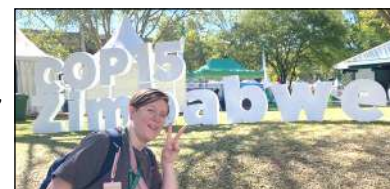
At the conference!

Our business trip lasted one week: from July 24 th to July 30 th . With several connecting flights, it took about 24hrs including layovers to get to Zimbabwe. We were only there for four days and three